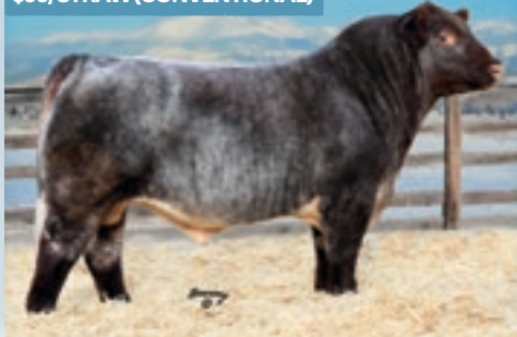
HILL HAVEN FIRE STORM 28C 95.4% X[CAN]*21983 A Champion siring Champions