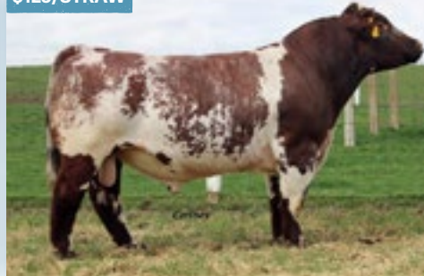
CSF EVOLUTION HC 93% X[CAN]AR21874 Deceased Safe on heifers – Structure, Substance & Style