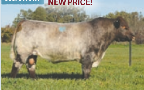
KAMILAROI MEAT PACKER Purebred [CAN]M478344 Australian Import Total Outcross Genetics