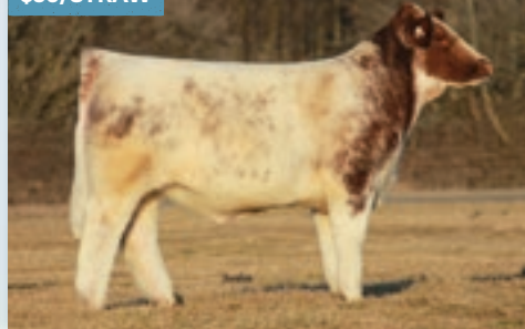
SHADYBROOK HENNESSY 32Z 90.7% X[CAN]AR19770 Adds Power, Bone, Muscle and Hair